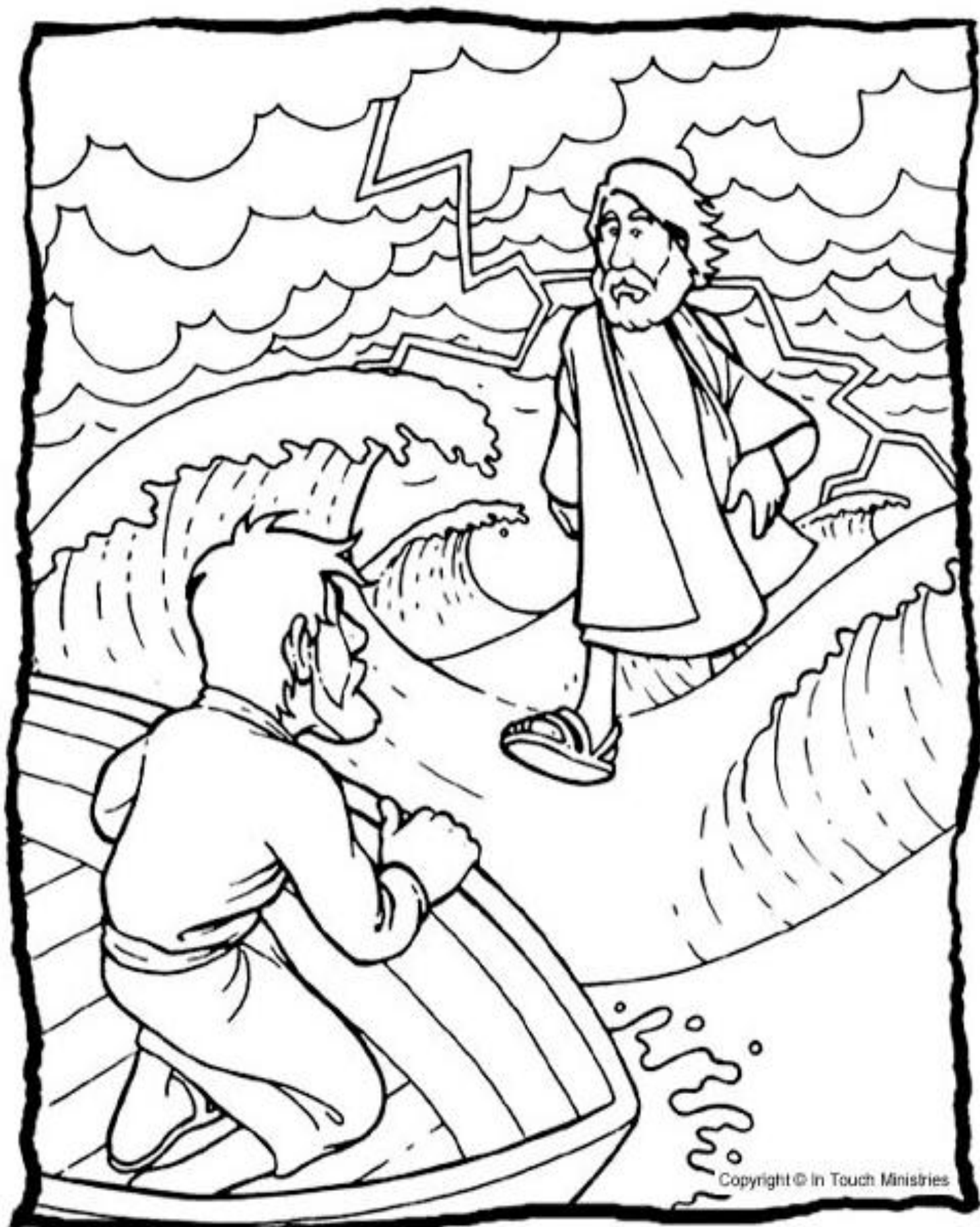
Jesus Walking on the Water